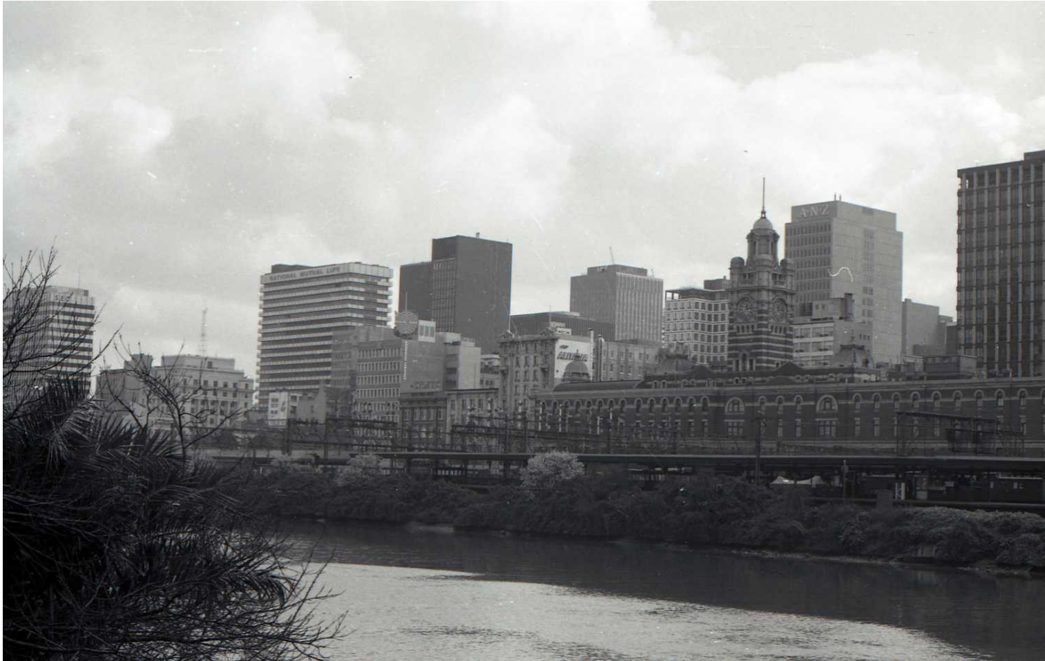
Yarra and city views