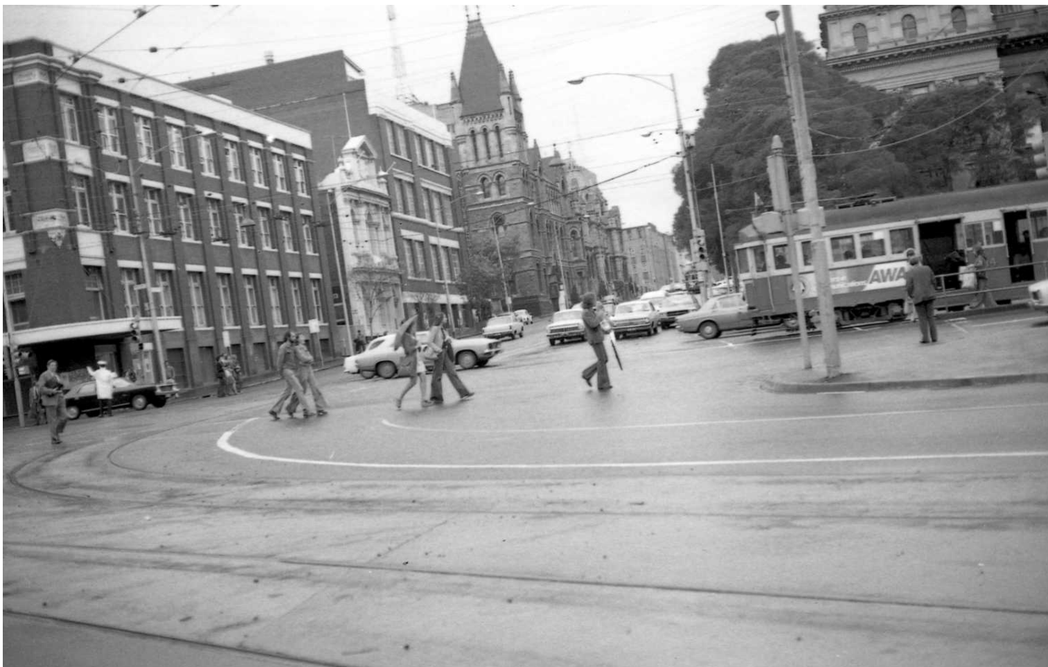
City Scene near RMIT from Neg Folder 1