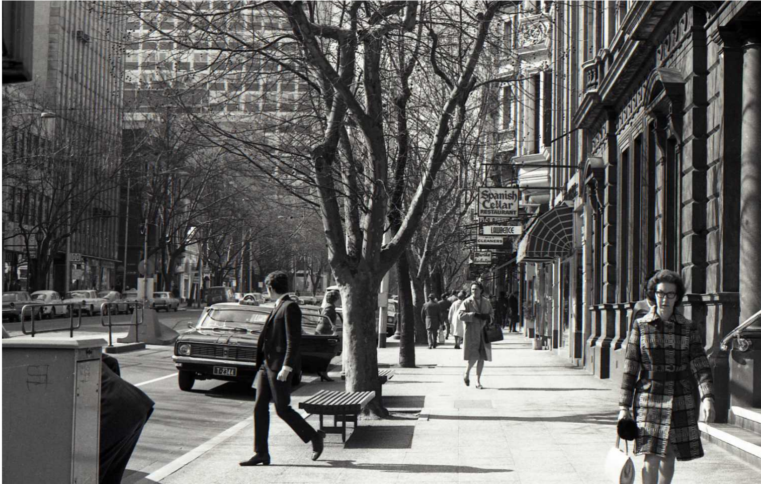
Top of Collins Street, Melbourne.