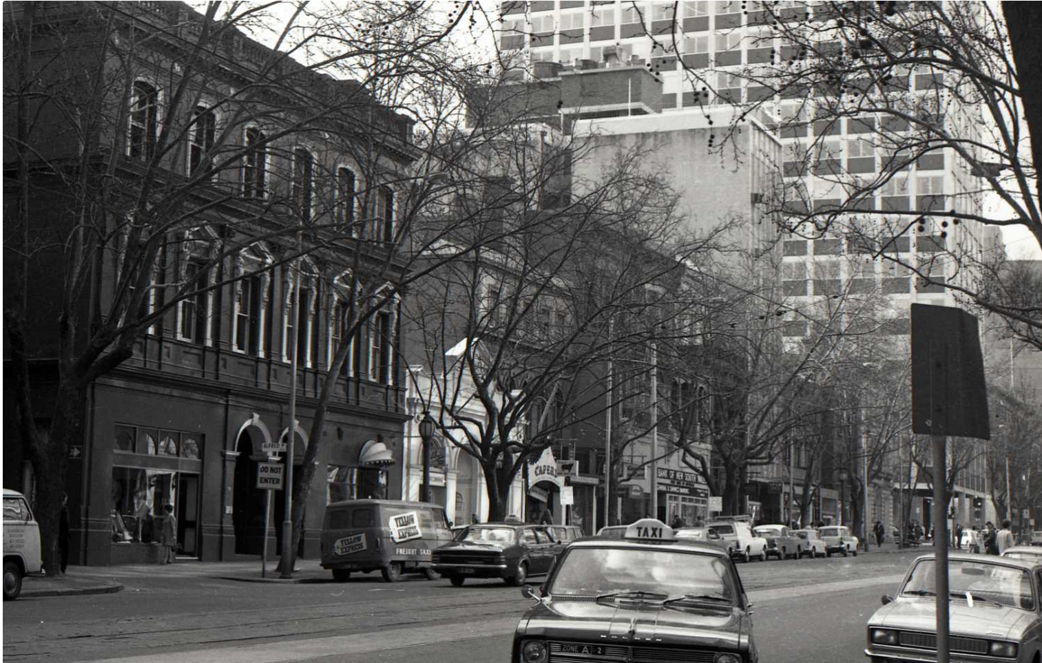
Top of Collins Street, Melbourne.