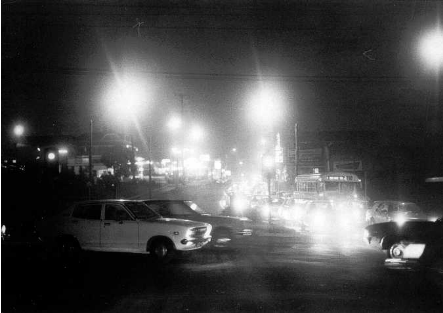
Early 70's night street scene.