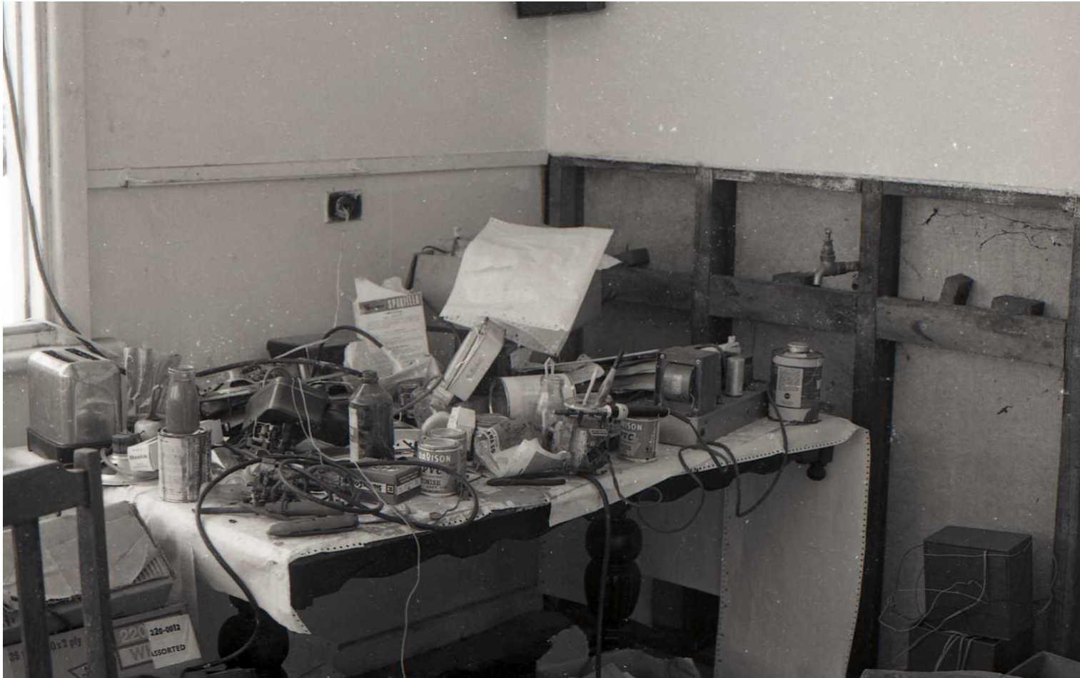
David's work table mid 70's.