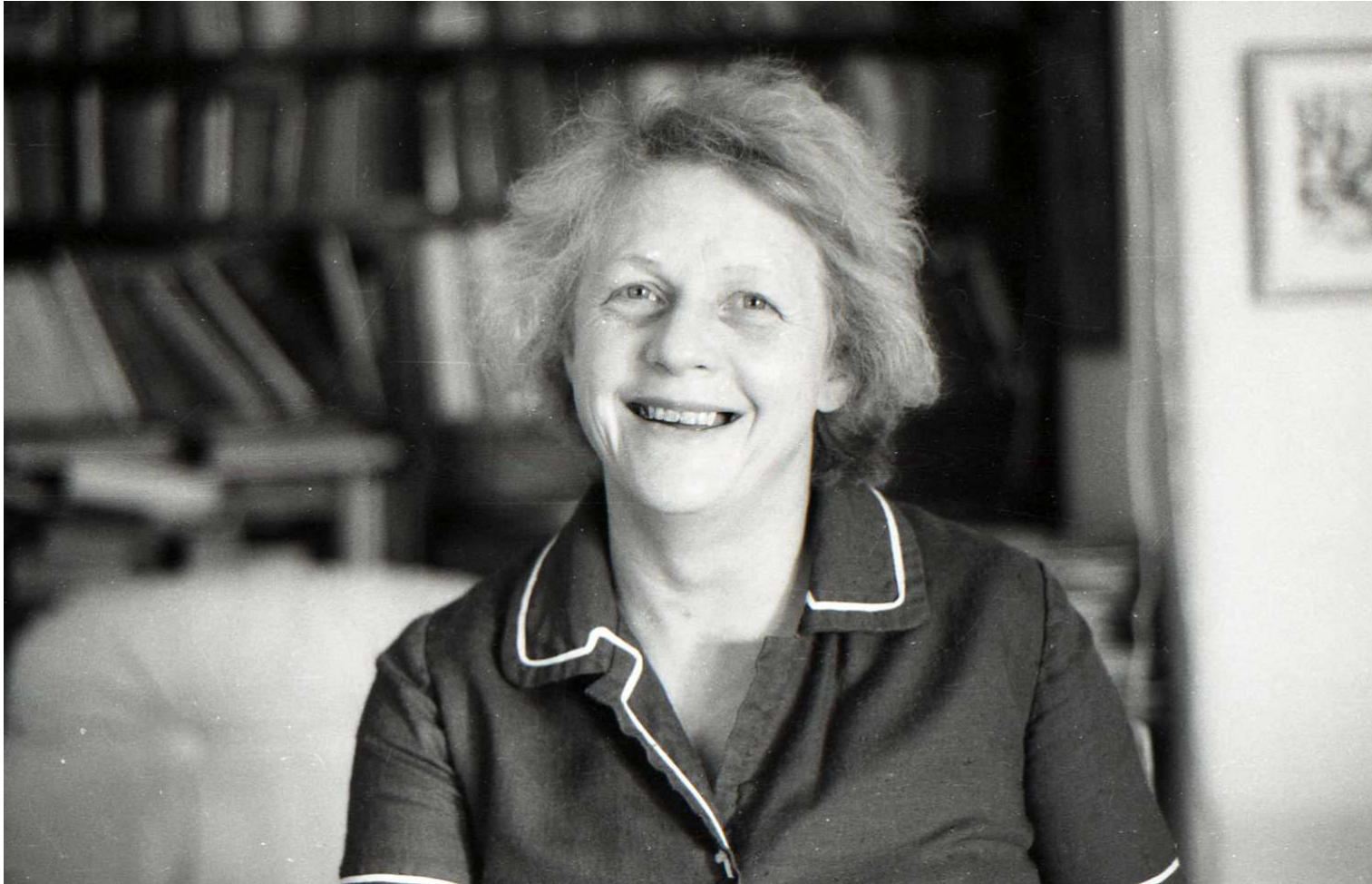
NCC at Redmond Street