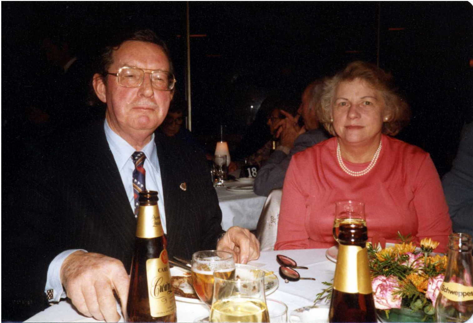
CCC and NCC out for dinner