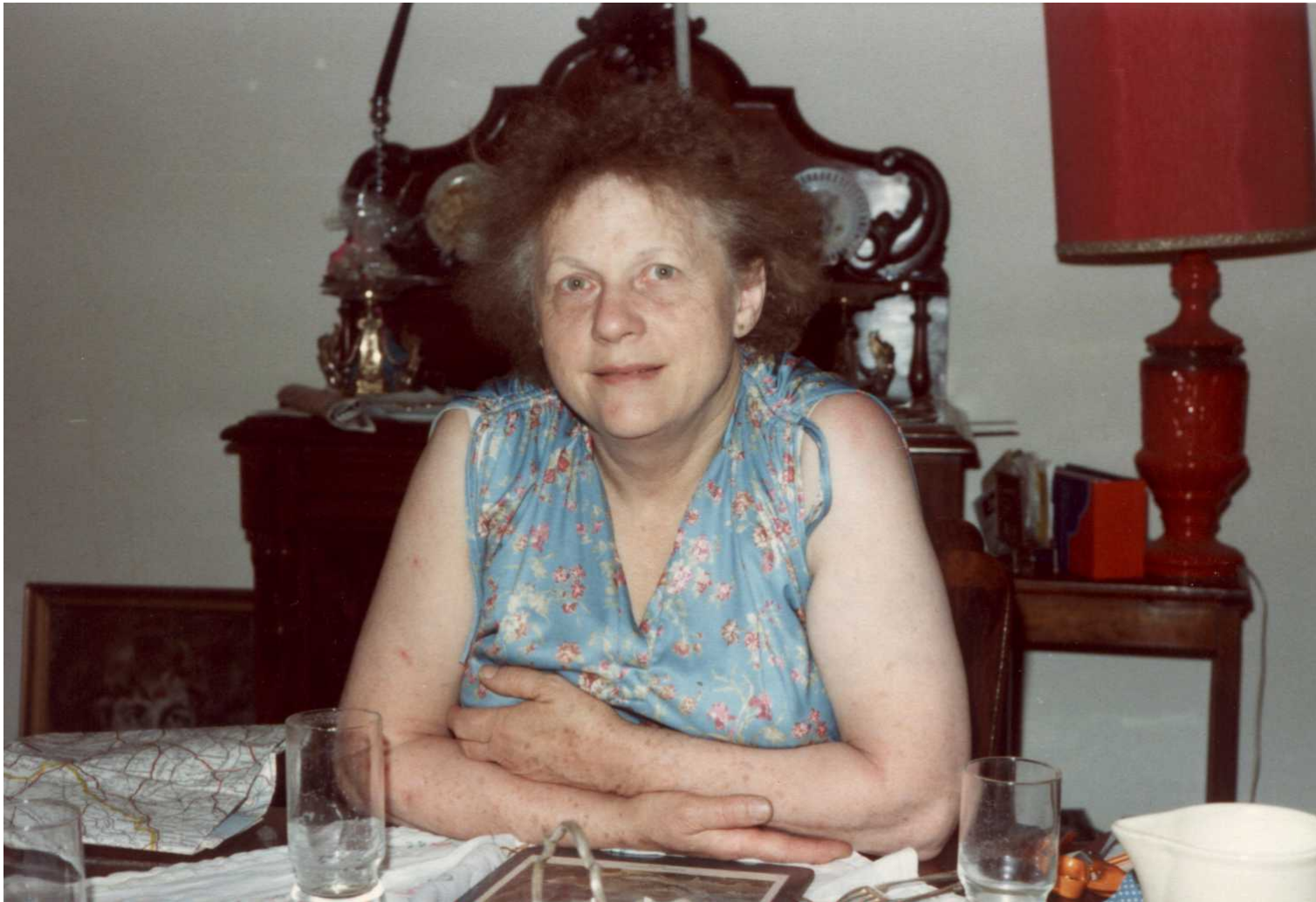
NCC at 4 High Street. Developed Jan 1982