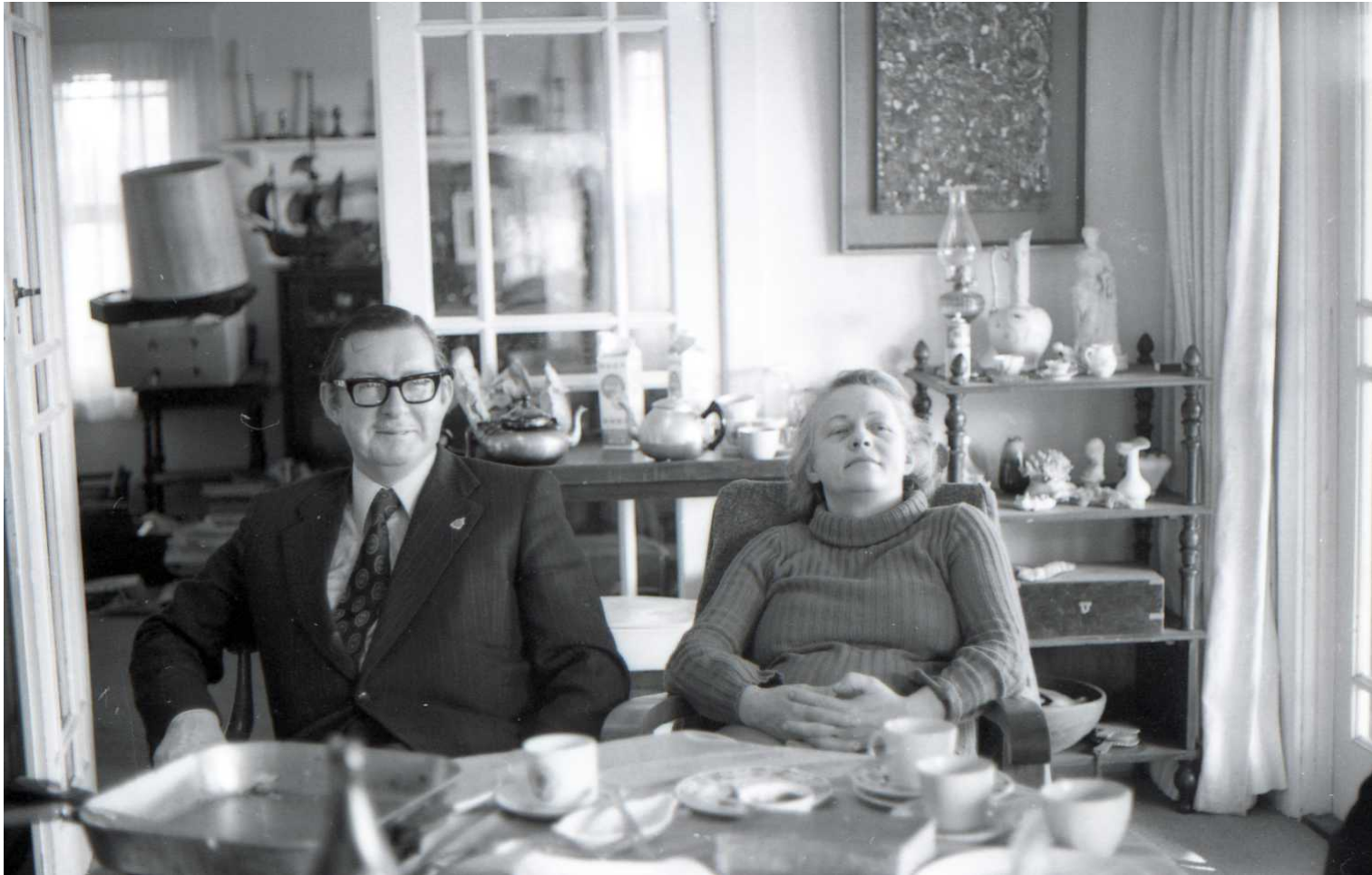
CCC and NCC in the Dining room at Redmond Street.