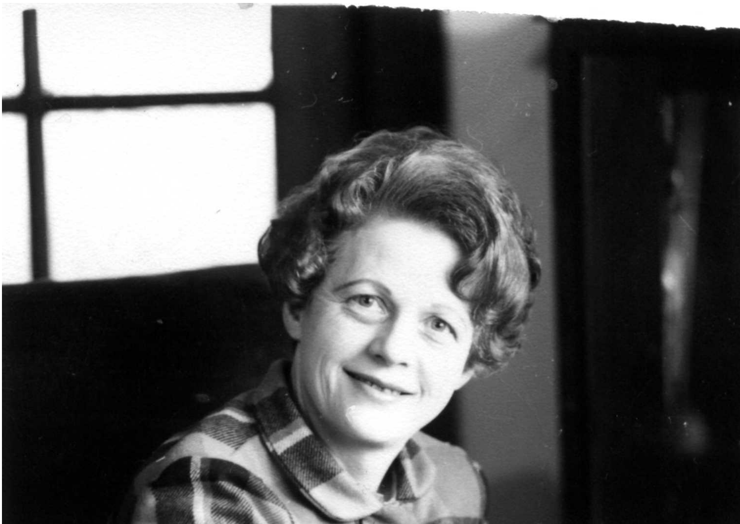
NCC Black & White photo